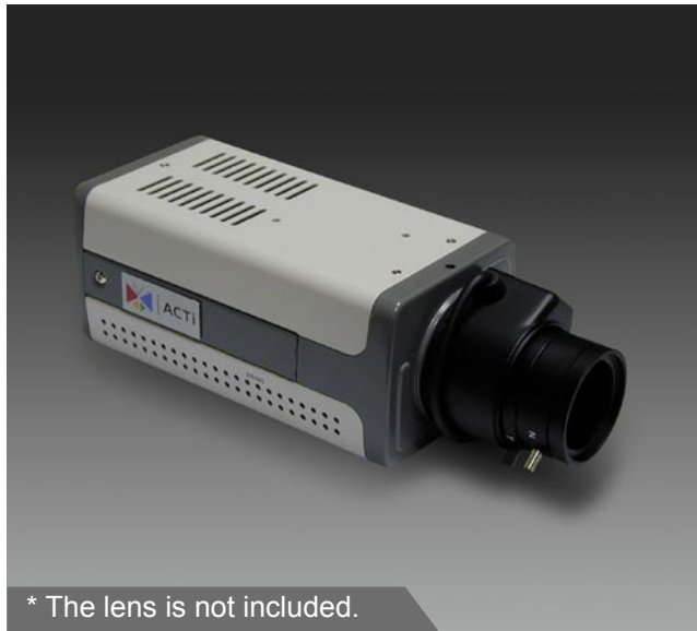
* The lens is not included.